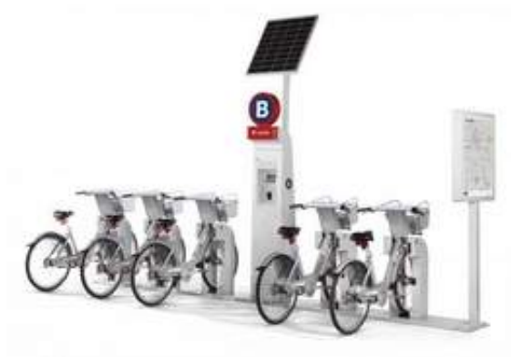
DOT recommending grant for University of Iowa bike share program