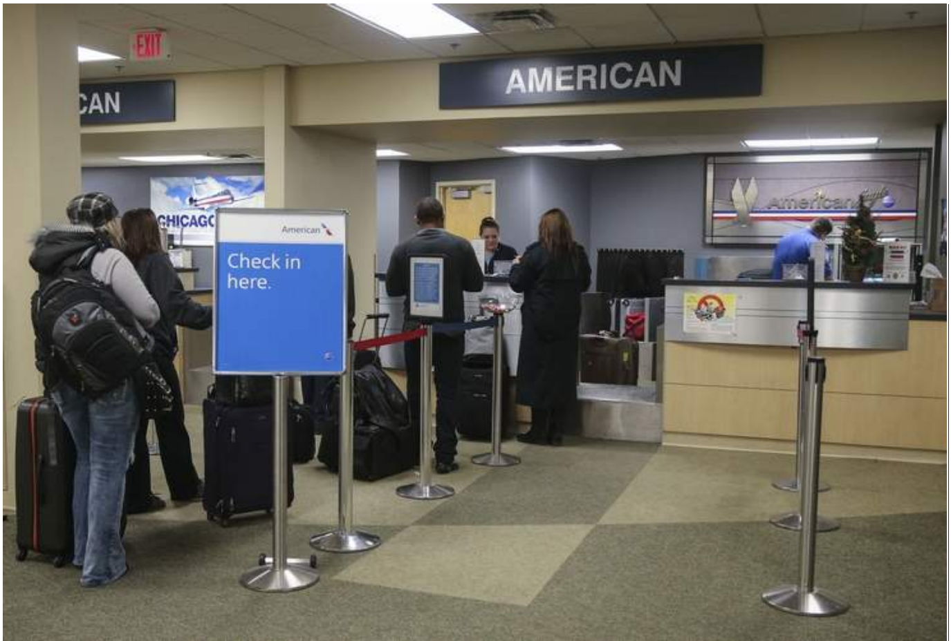
Passengers check in for an American Eagle flight to Chicago O'Hare International Airport at the

Start your FREE subscription to The Gazette News and Sports newsletter! x close http://www.gazette.com/subscribe/ly/TheGazette