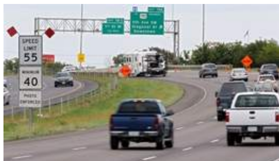
Cedar Rapids, Gatso questioned fairness of speed camera locations